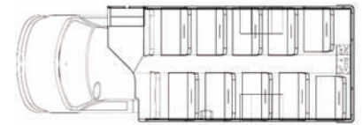
DH500 - 28 Passenger