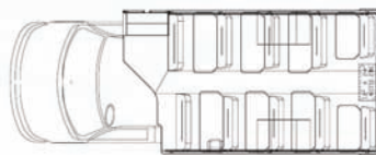
DH400 - 22 Passenger