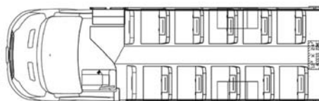
TH500 - 20 Passenger