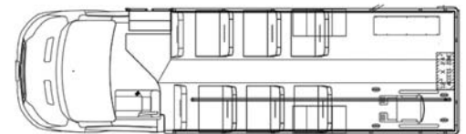
TH516WR - 12 Passenger w/1 WC

Due to ongoing engineering improvements, Collins reserves the right to make changes without notification.