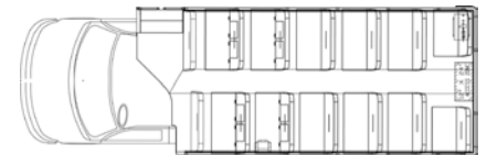
DE516 - 35 Passenger